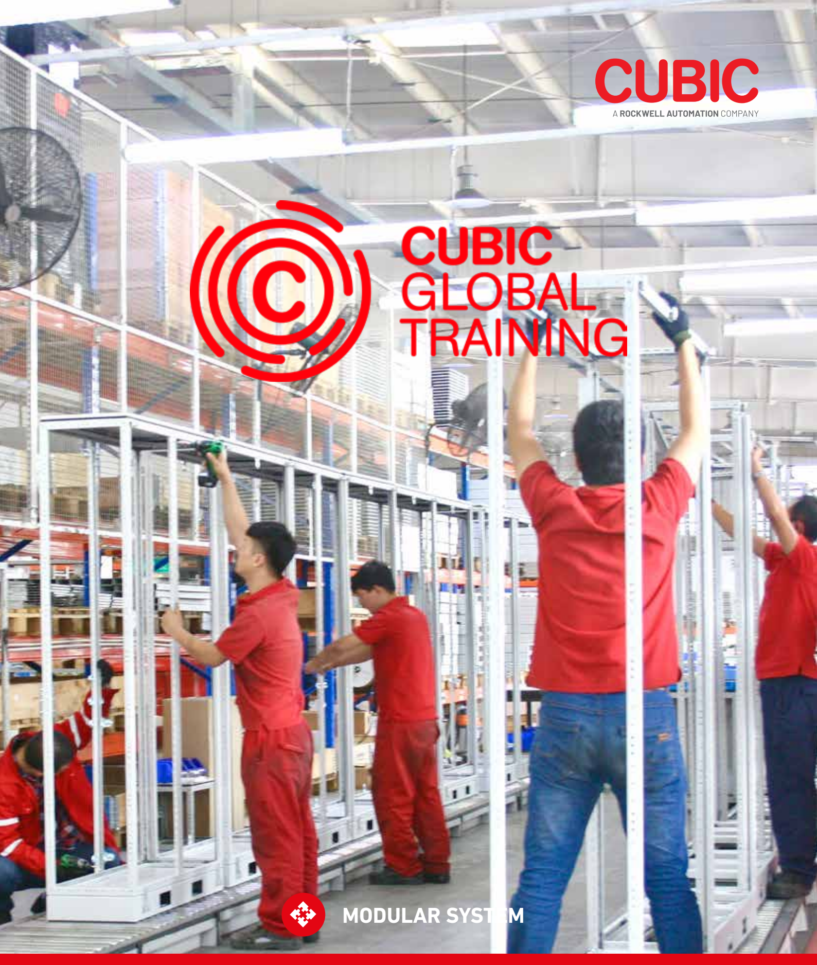
The CUBIC Global Training programme is developed for ASSEMBLY manufacturers who have made an "Agreement on Cooperation" with CUBIC (original manufacturer) to use the modular system as per documentation.

It represents a joint commitment that can be relied upon by consultants and end users worldwide for switchboards based on the CUBIC Modular System.